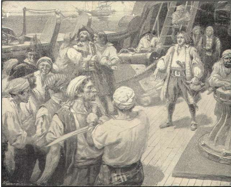
MORGAN BEGAN TO UPBRAID THEM, AND ORDERED THEM TAKEN BELOW.

hold. Having accomplished this, and feeling greatly elated by this piece of sly vengeance, he went into his fine cabin, and he and his officers sat down to the grand feast he had prepared.